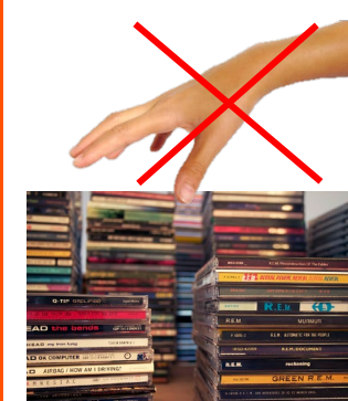
To not touch other people's things