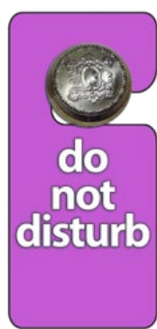
To privacy in your room etc.