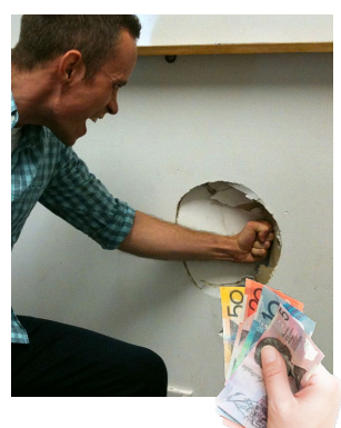
To pay for damage you do