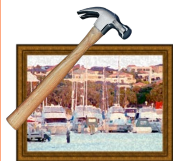
To ask permission before putting up any fixtures