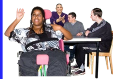
To be involved in decisions about you