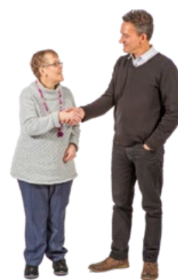
To respect others: (staff / residents)