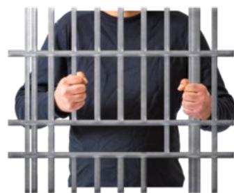
To not break the law