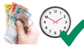
To pay your rent on time