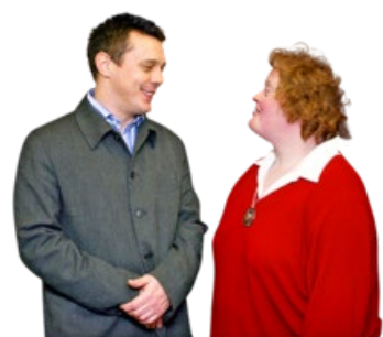
To use manners & listen to others