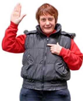
To be treated as an individual