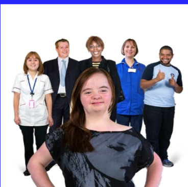
To support that restricts your rights in the least way