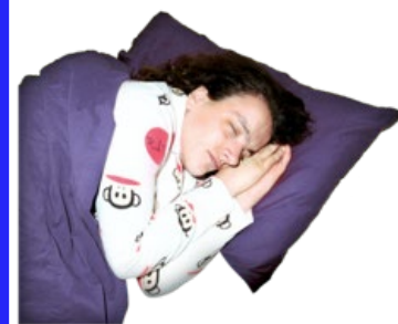
To feel safe in your home