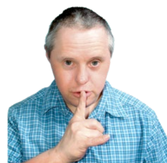
To respect the privacy of others