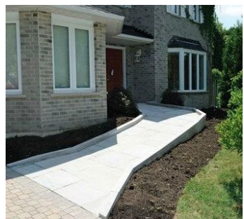
To live in a house that is in good repair and is safe