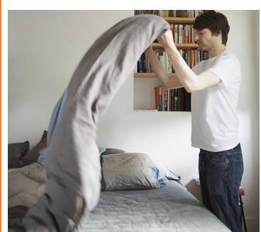
To look after your room