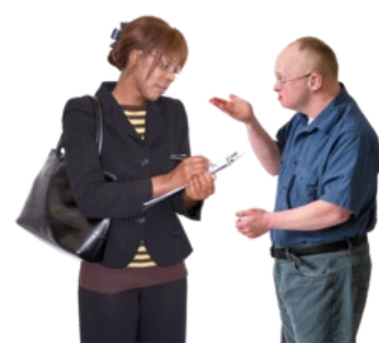
To talk about problems or make a complaint