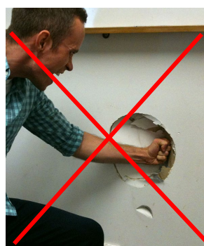
To not damage the house in any way