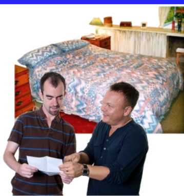
To be told if changes are about your bedroom