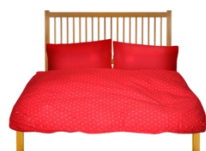
Making your bed