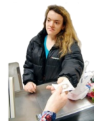
Paying for things