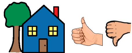
About the house Good things / Bad Things