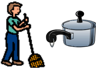
Chores Person Centred Active Support