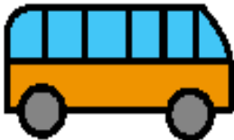
Outings / Activities