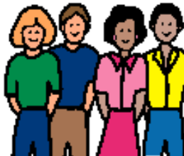
Staff / Visitors News