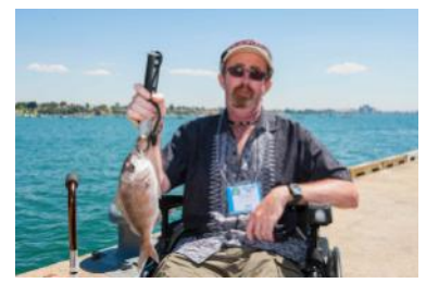
The One that Didn't Get Away Fishing at The Pier