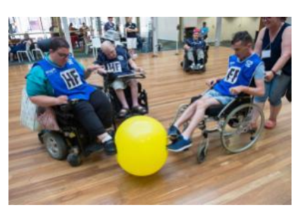
Bringing out competitive spirit Wheelchair Balloon Football