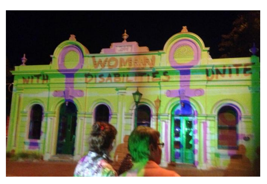
Photo 'Women with Disabilities Unite' Speak Up Alexandra Start Community Art Projection

Our first meeting for the year was held on the 15<sup>th</sup> of March with the Self Advocacy Resource Unit (SARU) and stART Community Art who are closely associated with SARU.