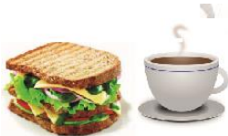
Cafe on Level 1