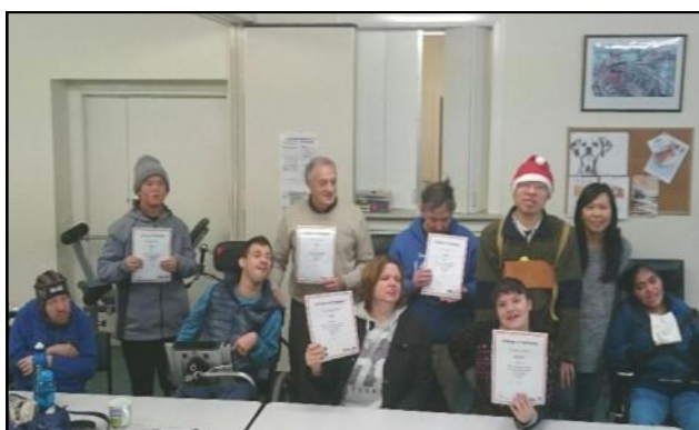
Pictured above: Some of the groups who have completed the Keys to Success Self Advocacy training.